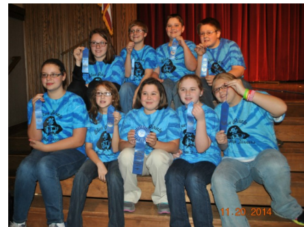
The Williamsburg Page Turners with their 1st Place ribbons!

What you do for the competition is read eight to ten chapter books, and you go to the school it's at and answer questions about the books you read. I am a member of the team, and the questions can be difficult, so you have to make sure you know about what you read. If you like to read, I'm sure you would love this competition!